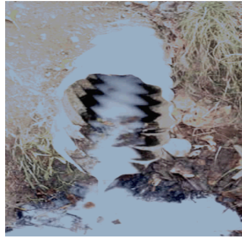
Point source pollution dumping excess nutrients into stream.

There are two main types of nutrient management: point source and non-point source. Point source pollution comes from a specific, known source, usually a regulated industry like a waste water treatment plant. Potential tactics for management include increasing discharge requirements, creating a diversion of point source waste, requiring operational adjustments, and implementing pollution prevention plans. Point source pollution management has the potential to create a large reduction of nutrients but can also be very expensive and politically difficult to implement.