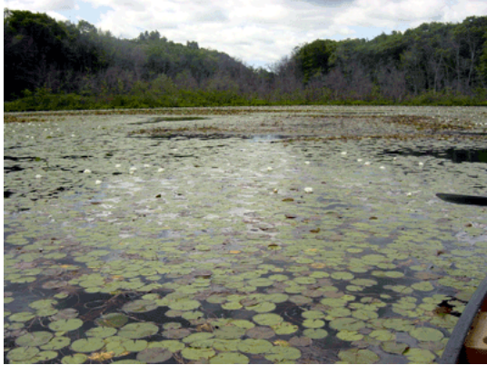
This photo of Long Lake in Littleton, Massachusetts shows invasive aquatic plants which have grown rapidly in response to nutrients from runoff.

( http://www.mass.gov/envir/lid/examples.htm )