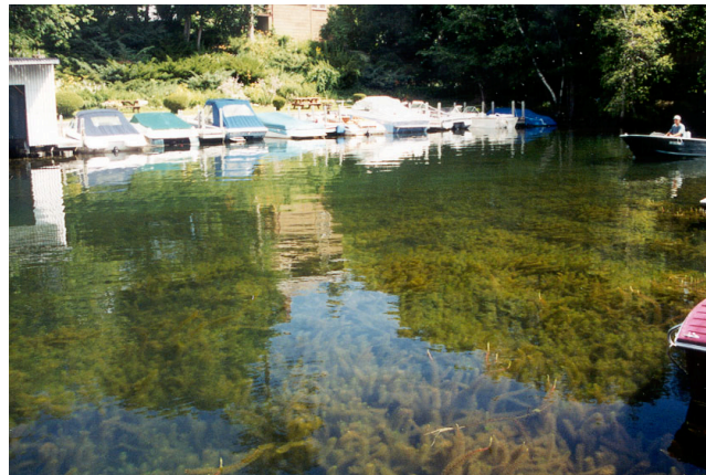
An infestation of Eurasian milfoil in Squam Lake in New Hampshire.

Many invasive aquatic plants appeared in America very early in our nation’s history. For example, Purple Loosestrife was introduced to America in the 1800s, both unintentionally on ships’ ballasts and intentionally as a medicinal herb and decorative plant. 4 Some invasive species, including the Purple Loosestrife, which has attractive purple flowers, were purposely planted in lakes for aesthetic value. However, once in their new habitats these plants have spread quickly crowding out native plant variety and making the lake habitat unsuitable for many native fish, amphibians and other wildlife. Certain states ban the purchase and sale of invasive species, but some nurseries still sell invasive plants. Be