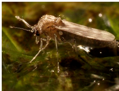
Midges are also a method of biologically controlling invasive plants.

http://www.ecy.wa.gov/programs/wq/plants/management/weevil.html