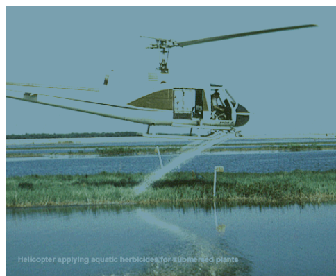
Helicopter applying aquatic herbicides for submerged plants ( http://aquat1.ifas.ufl.edu/seagrant/soherb2.jpg )

Highly water soluble, Fluridone remains in the water one to fifty-two weeks. It is restricted from use within 1/4 mile of any drinking water supplies (both surface and well). Costs can range from $500-$1000 per acre for the first treatment and then up to $2000 for the subsequent treatments.