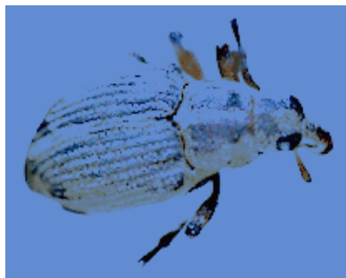
The milfoil weevil ( Eubrychiopsis lecontei ) is a known control for Eurasian Milfoil.

Herbivorous insects are insects that are identified as natural predators of certain problem weeds. These insects are then purposely added or “stocked” into a lake or pond to eat the problem weed. The insects are stocked as larvae or adults depending on the insect species and the extent of the plant infestation. Plant control is a rolling cycle: the plant dies back— followed by the insect